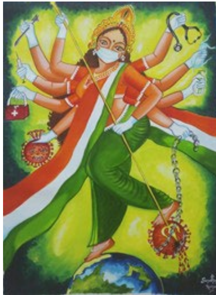
Image by artist Sandhya Kumari, located in a gallery in Kolkata, reproduced on posters and also used as a template for goddess figures and statuettes in the form of murtis all over the country.

Bharata Mata, the Hindu nationalistic veneration of India as a goddess, also was very actively used during the corona pandemic. This can be seen in the following picture: