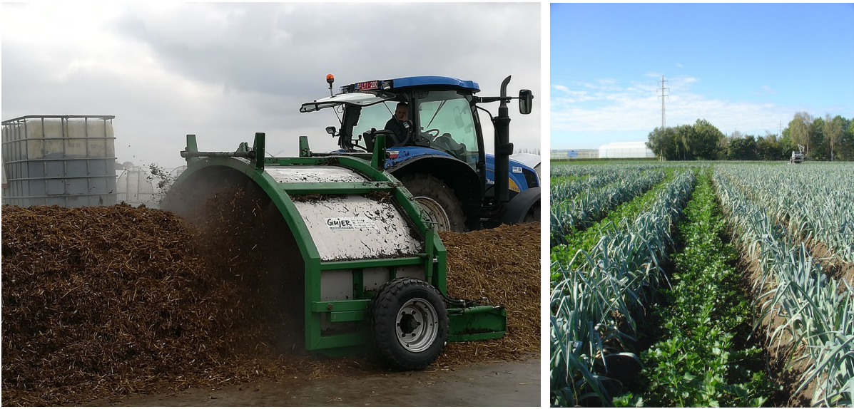
Picture 1: Left: Preparation of compost as alternative fertilization product. Right: Celeriac and leek growing in an intercropping system in Belgium.