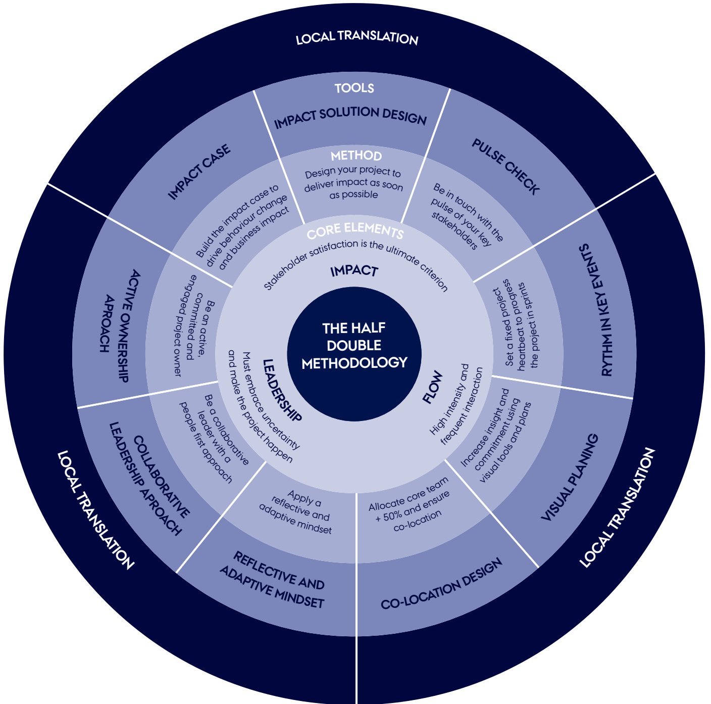
FIGURE 1: THE HALF DOUBLE METHODOLOGY