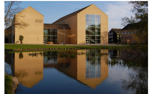
Venue for the Congress Aarhus University, Lake Auditoriums

The role of epidemiology in combatting diseases of modern societies