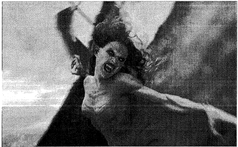
Figure 1. A highly attention-demanding alpha predator from Van Helsing (2004)

You're trapped. Some monstrous and malevolent force—weird, alien, and hideous—is about to take your life, devour your flesh, and consume your soul.