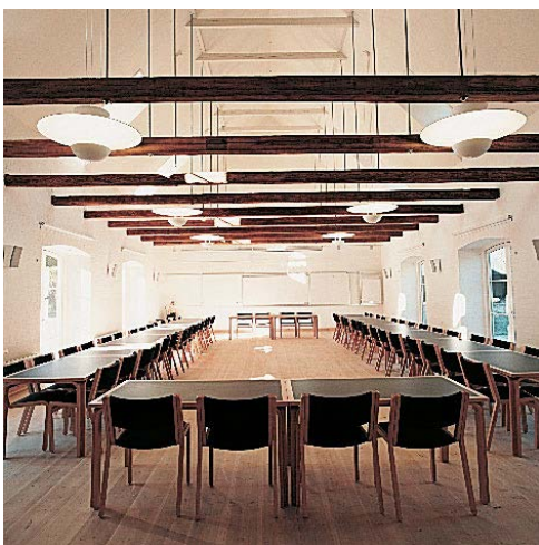
We will meet in the Stable Auditorium (C): For more information on the location:

This format focuses a bit more on "getting to know" the researcher compared to traditional conference presentations. To model this format for presentation, members of the committee will go first and present people, topics, and studies from Denmark and Switzerland.